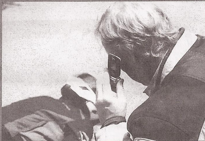
As soon as you determine what help is needed from the police, fire department or ambulance, call the local emergency number, which is usually 911.

As soon as you determine there are injured victims, or that police are needed for any reason, call 911 or another local emergency number. The dispatcher will want to know the exact location and if