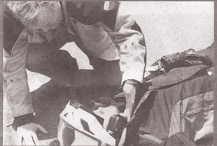
If the victim is unresponsive, check for breathing and feel for a pulse at a carotid artery, located on both sides of the neck. (Try this on yourself now to learn the locations.)